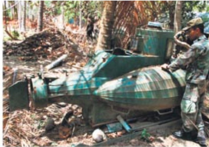
The small underwater vehicle designed for one person captured by the troops of 7 SLSR in an abandoned Sea Tiger base located in Puthukkuduyiruppu East