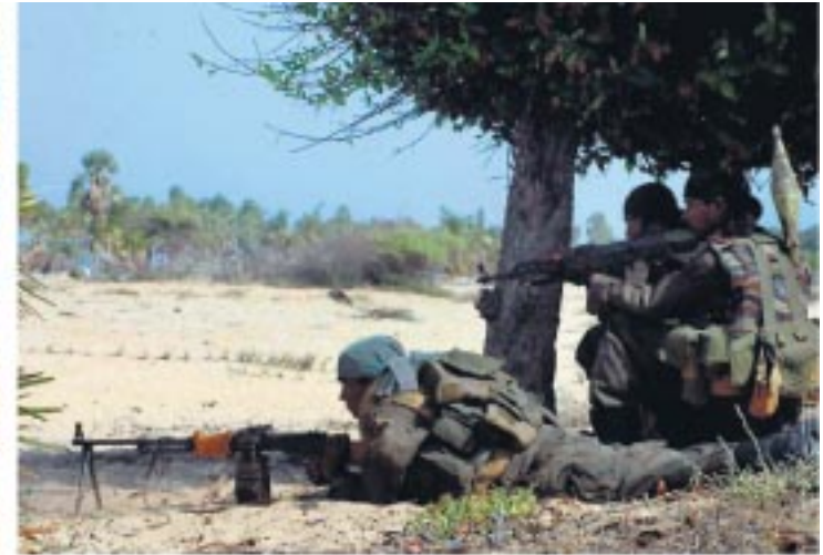
Sri Lankan Army soldiers operating in the south of Chalai