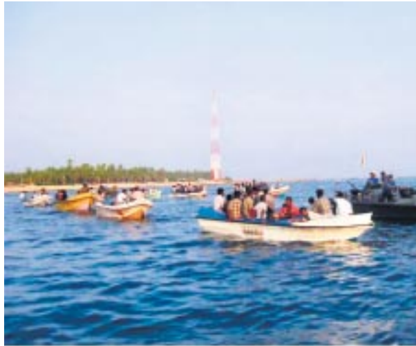
Fleeing civilians in dinghies rescued by the Navy