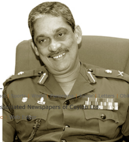
Lieutenant General Sarath Fonseka

A: I am grateful to Prabhakaran for selecting Mavil Aru. It was the correct place to start off this military battle. It had created the best environment to start attacking him to destroy terrorism. The LTTE was considered to be one of the powerful terrorist outfits in the world due to certain propaganda at that time. From Mavil Aru we disproved all those views. This military thrust to destroy the LTTE has pushed Prabhakaran - who was born and bred in the beaches of Welwattithurai-back to the beaches of Puthumathalan.