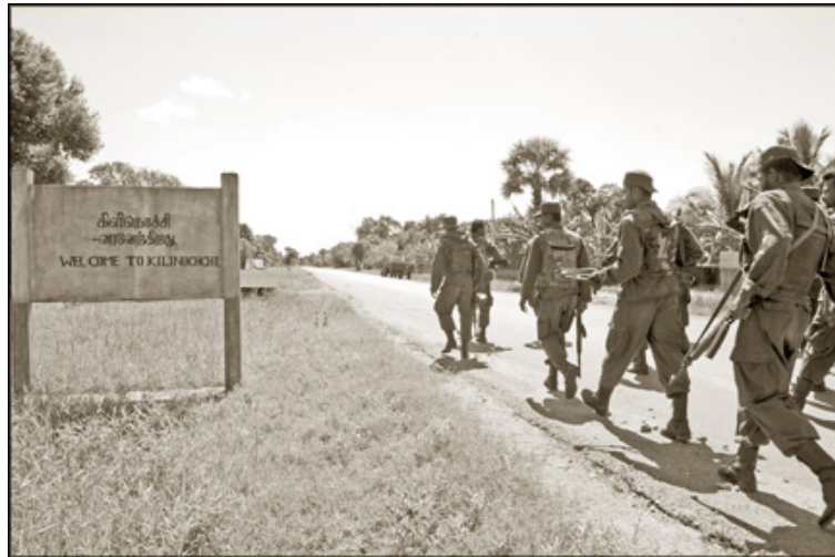
Forces' movements have been misinterpreted by media.

U.S. 'Almost All Wrong' on Weapons: Report on Iraq Contradicts Bush Administration Claims' carried an article in Washington Post in October 07, 2004. "A controversy has existed over the performance of U.S. (and British) intelligence in collecting and evaluating information about Iraqi weapons of mass destruction programs. The reliability of sources has been questioned.